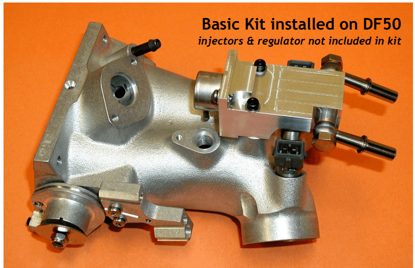
Basic Kit installed on DF50 injectors & regulator not included in kit

Currently bikes are running with ICT engine control units & we are developing combinations using alternate ECU's. Give us a call if you have any questions regarding your application or to place an order